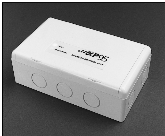
Part no 55000-823 (surface mount)

A polarising diode is required with each alarm device, as sounders are operated by voltage reversal, provided by a double-pole change-over relay. The sounder circuit is protected by a miniature (TR5) fuse rated at 1A.