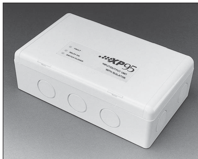
Part no 55000-847

The output (or forward command) bits from the control panel have the following function: