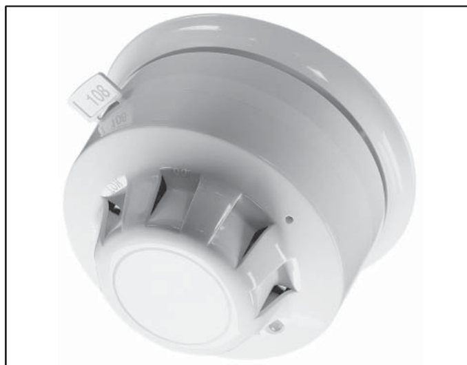
Part no 45681-265 shown with an optical detector

Allocation of more than one sounder to a single address is achieved by a new design known as the 'master/slave' concept. This is quite different from the group address system used by the Apollo Sounder Control Unit.