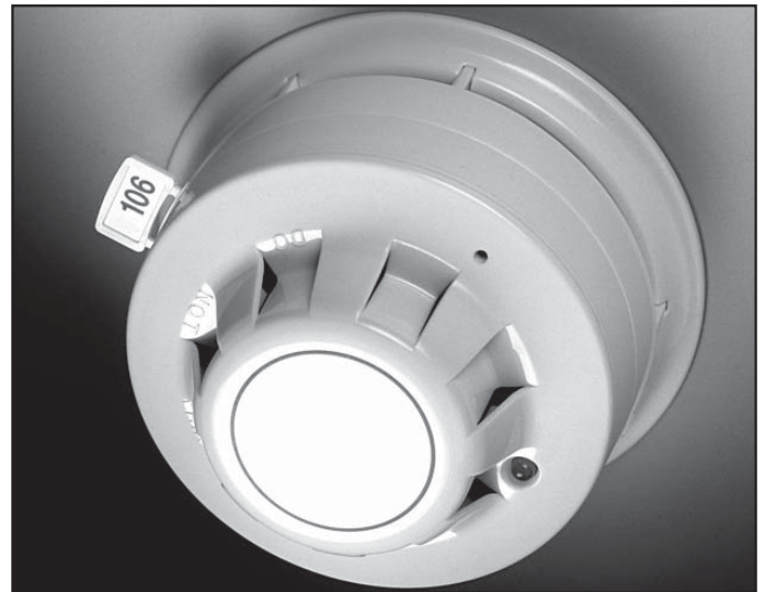
Part no 45681-276 with XP95 optical detector fitted

The Ancillary Base Sounder is loop-powered and requires no external power supply. It operates at 17-28V DC.